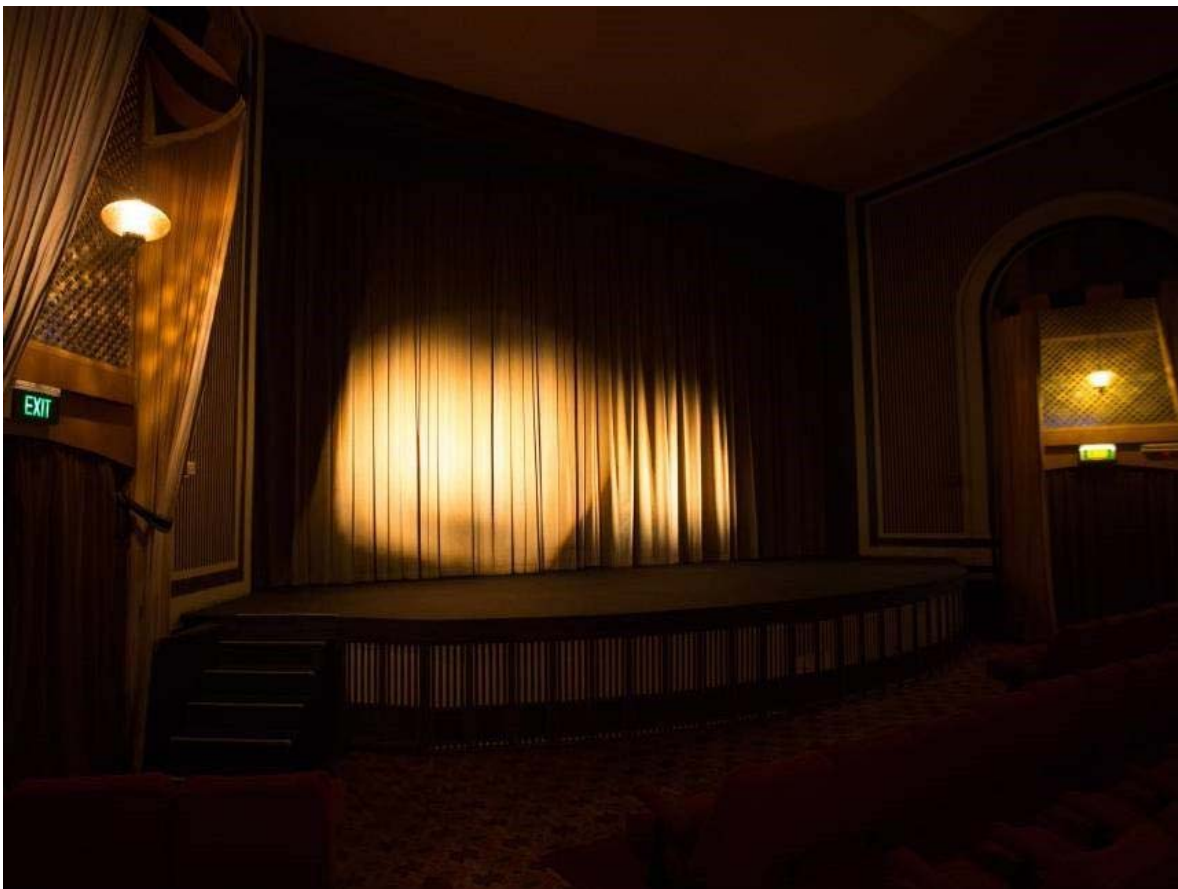
Inside the haunted Regent Theatre.