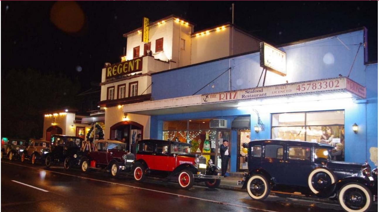
The Regent Theatre has been operating since the 1930s.