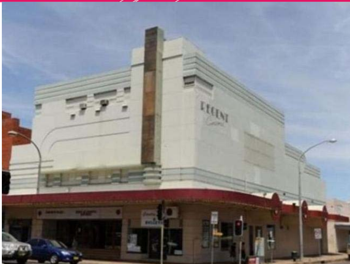
The Regent Theatre in Tamworth.

Similar name, but by all reports less haunted, is the Regent Cinema in Tamworth.